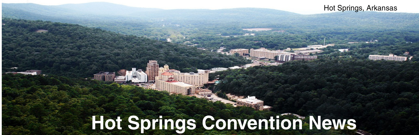
Hot Springs, Arkansas